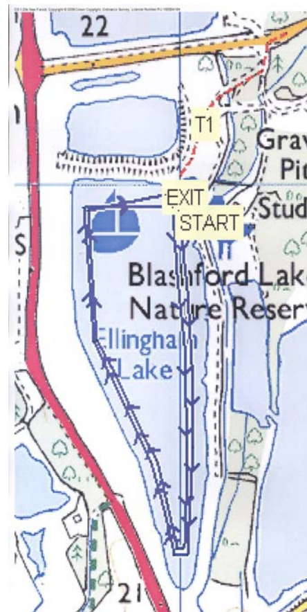
Swim Route—Ellingham Water Ski Lake

Please Note that the land around Ellingham Lake is managed by Hampshire Wildlife & Conservancy Trust. It is also home to a childrens' wildlife study area. This land is out-of-bounds to competitors and spectators on race morning. Anyone found trespassing on this land and in particular using it as an outdoor toilet will be removed from the race, banned from all future events, and may be liable for prosecution.